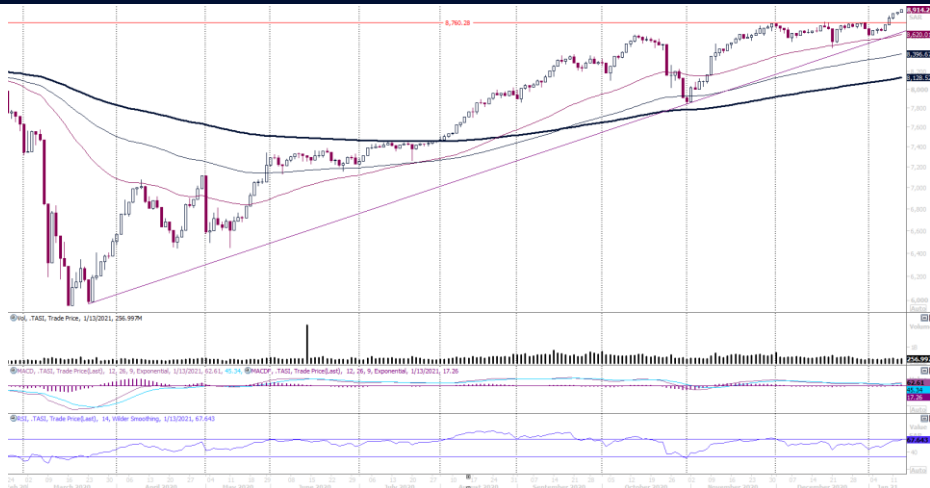
TADAWUL ALL-SHARE INDEX – DAILY CHART