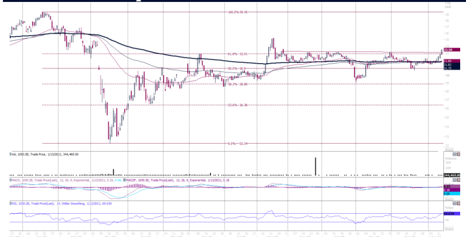
Banque Saudi Fransi – DAILY CHART

The Index moved above the 8,800 critical resistance level and, despite expected volatility, is expected to continue with its path north.