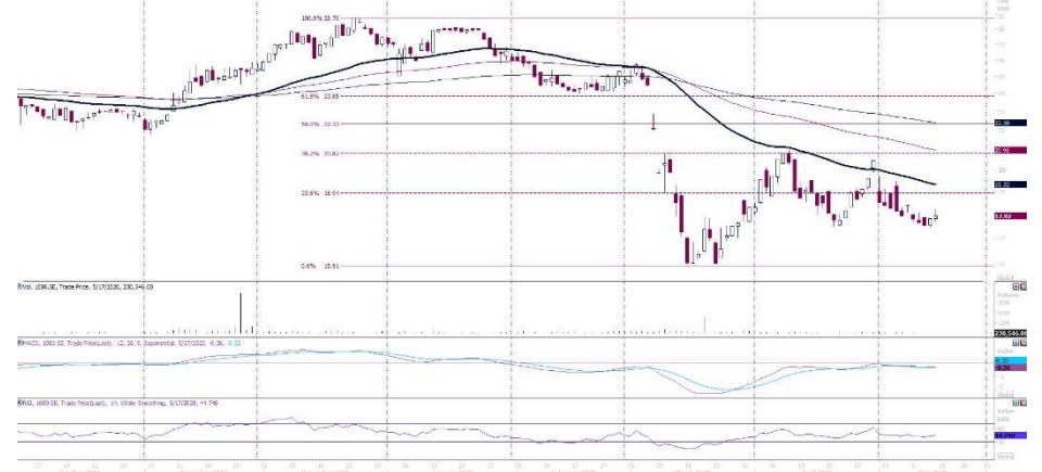
Arab National Bank - DAILY CHART

The Index failed to stay above the 50SMA and retreated under selling pressure.