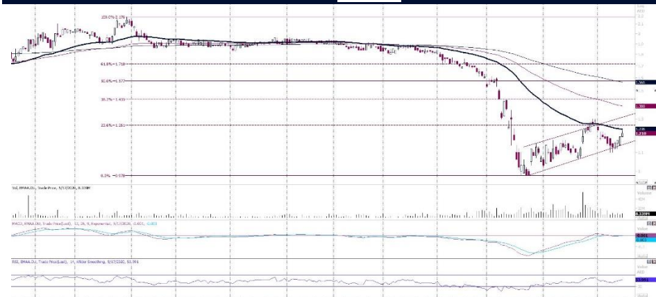
Emaar Malls – DAILY CHART

The pressure remains down on the in the Index, beware of the bull-traps.