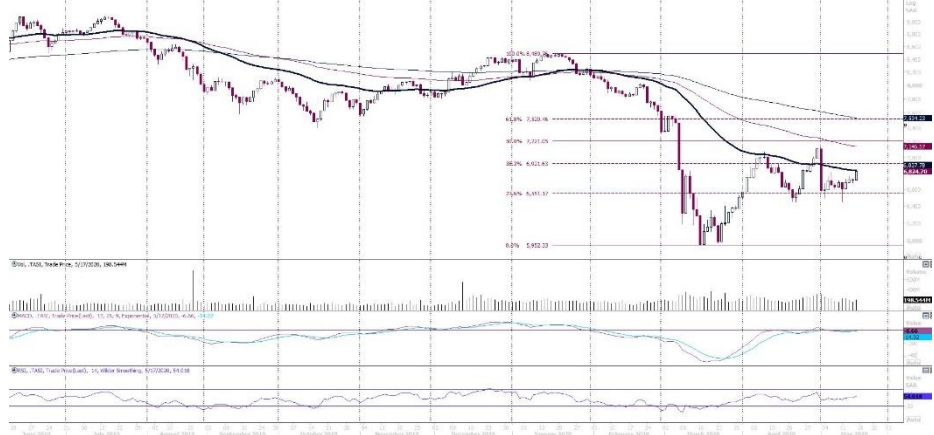
TADAWUL ALL-SHARE INDEX - DAILY CHART