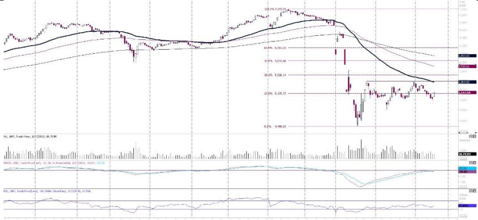
KWSE PREMIER MARKET - DAILY CHART