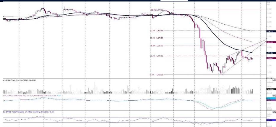
DFM GENERAL INDEX – DAILY CHART