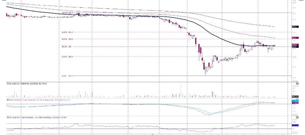
Qurain Petrochemical Industries - DAILY CHART

The Index has created a bullish flag formation, suggesting the uptick could continue against the downtrend in the short term.