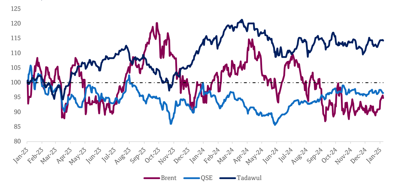
QSE Price Performance Vs. Brent and KSA [Rebased to 100]