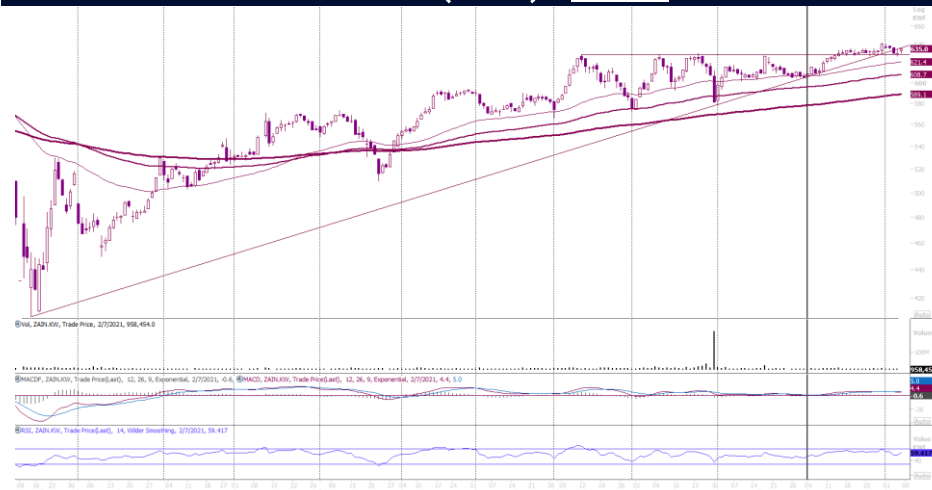
Mobile Telecomm (ZAIN) – DAILY CHART

The Index is expected to move higher in the short term as it started to move above the range it created November of last year.