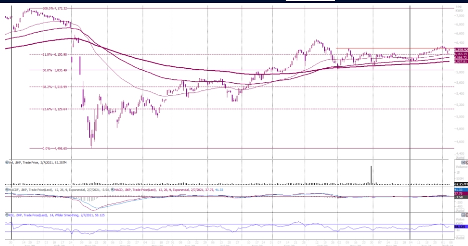
KWSE PREMIER MARKET – DAILY CHART