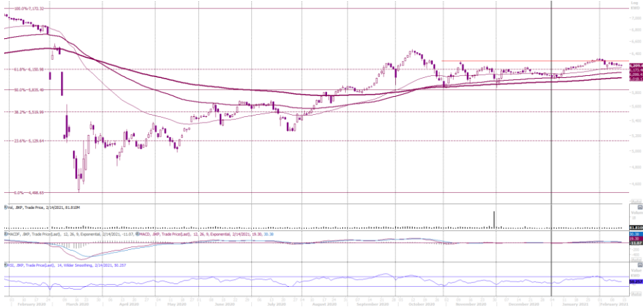
KWSE PREMIER MARKET - DAILY CHART