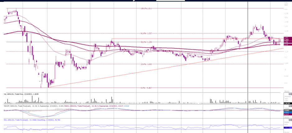
Air Arabia PJSC – DAILY CHART

The Index has been in a correction and is expected to weaken further in the short term.