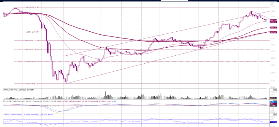
DFM GENERAL INDEX – DAILY CHART