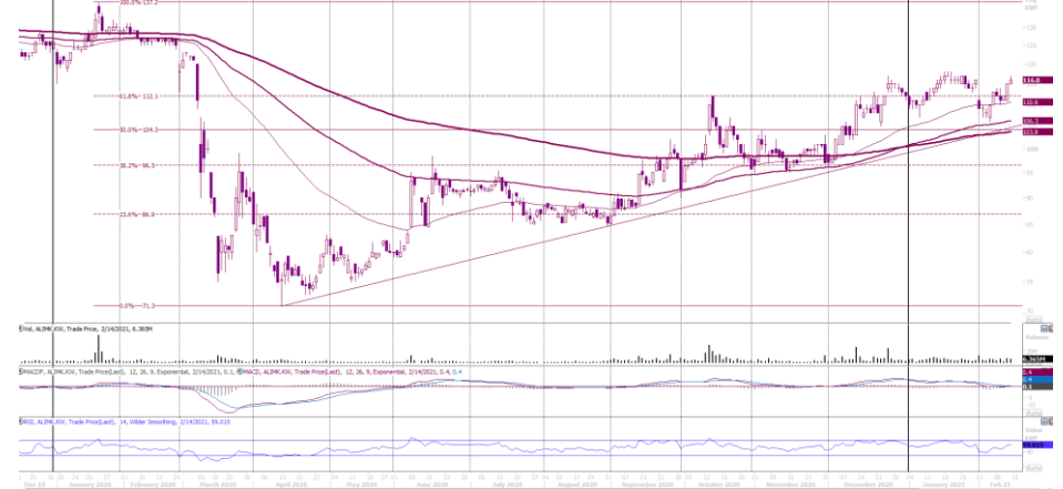
Alimtiq Investment Group Co - DAILY CHART

The Index is expected to move higher in the short term as it started to move above the range it created November of last year.