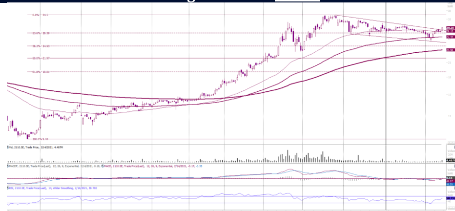
Aseer Trading Tourism – DAILY CHART

The Index has been corrective in its movement but remains above its two of its three major moving averages. We remain positive on the Index, and we await a reversal against the correction.