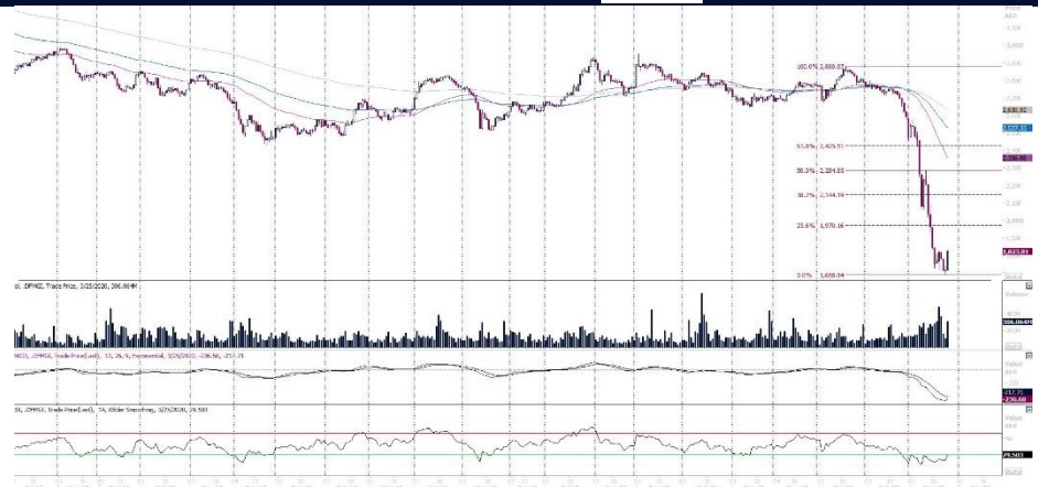
DFM GENERAL INDEX – DAILY CHART