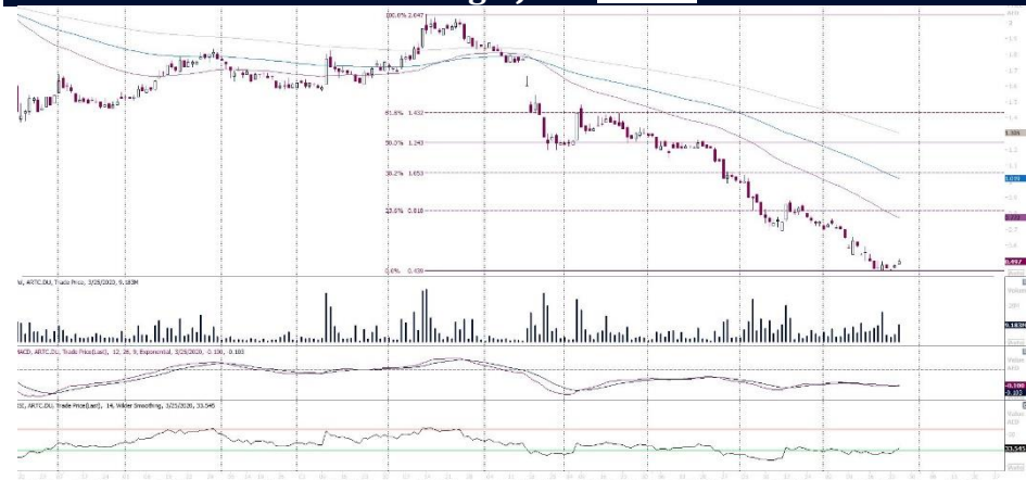
Arabtec Holding PJSC – DAILY CHART

The trend remains down, and the Index reached multi-year levels. However, indicators show extreme levels have been reached.