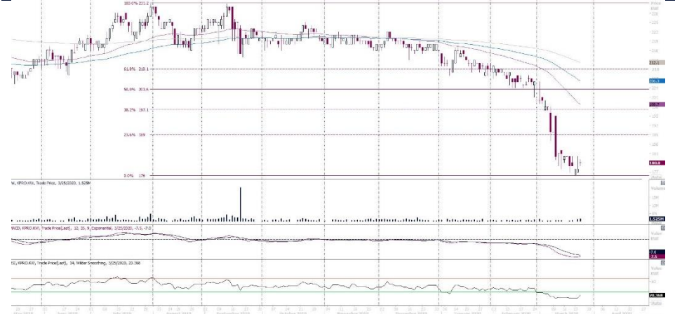
Kuwait Projects Company Holding KSCP - DAILY CHART

The Index is in relief rally mode and seeking direction as the selling pressure mounts.