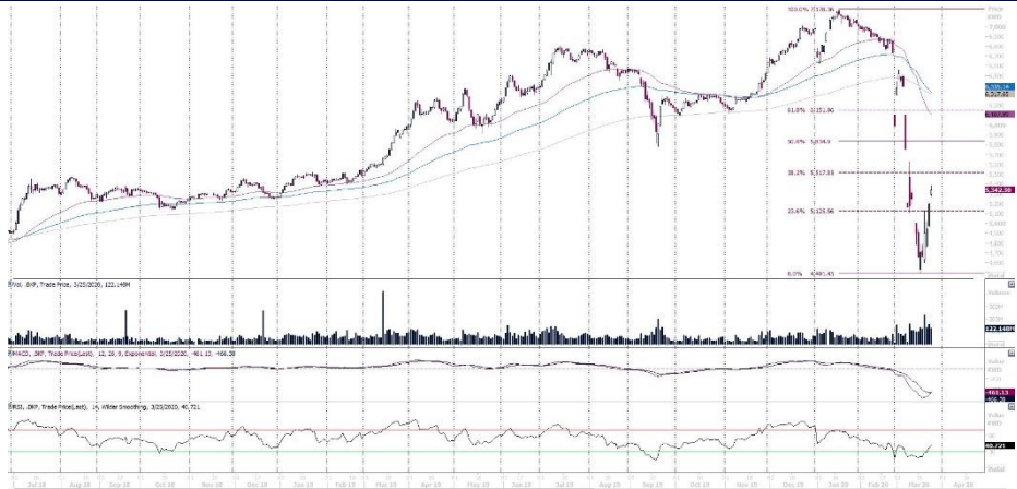
KWSE PREMIER MARKET - DAILY CHART