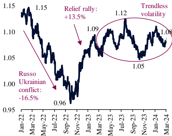
EUR:USD (FX rate, 2022-2024)

In our view, however, there is limited downside for the EUR in 2024. Indeed, we even see some scope for EUR appreciation in the coming quarters. Two arguments support our view.