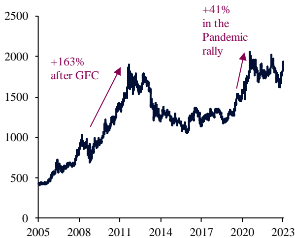
London Gold Bullion (AM fix, USD/Troy oz, 2005-2023)

Sources: Haver, Wall Street Journal, QNB analysis